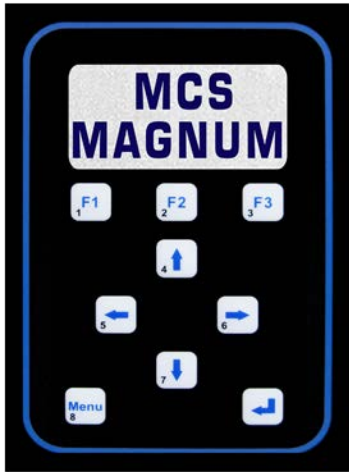
Part # MAG-KEYPAD-OEM-232-KIT Replacement for all Non-Warranty Keypads