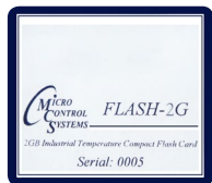
Compact Flash 2 Gigabyte Memory Card