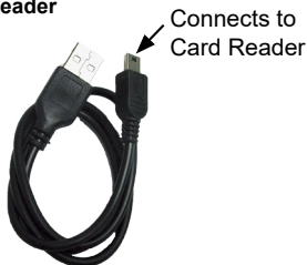
USB Cable for connection from Compact Card Reader to computer