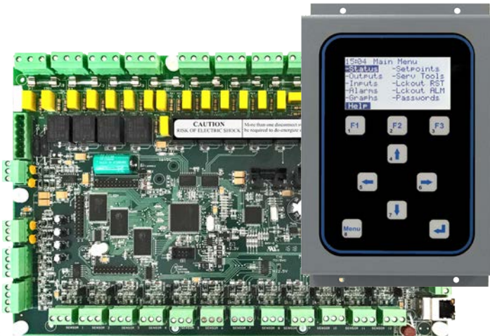
Part # MCS-MAGNUM-PANL