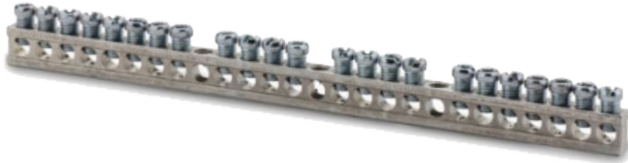
Part # MCS-GROUND-BAR