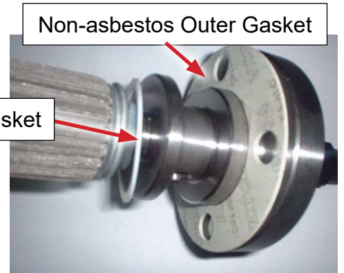
Non-asbestos Outer Gasket