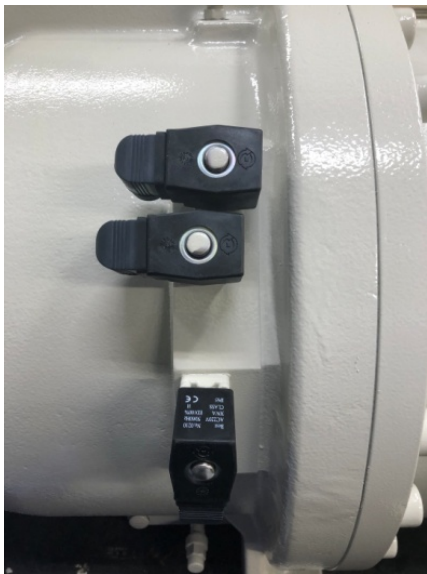
BEFORE (without black O-rings)