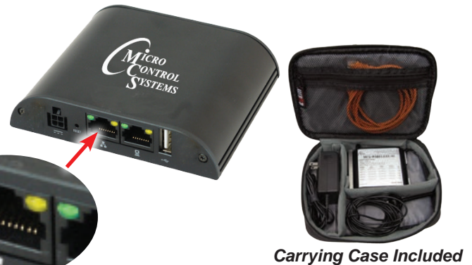
Carrying Case Included