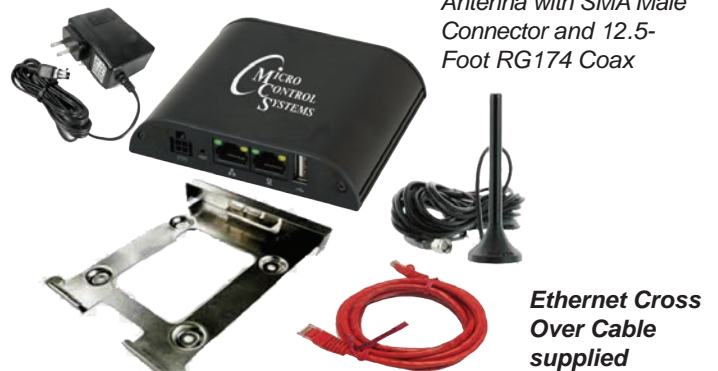
Ethernet Cross Over Cable supplied

Dual Band - 800-1900 MHz Mini Magnet Mount Antenna with SMA Male Connector and 12.5-Foot RG174 Coax