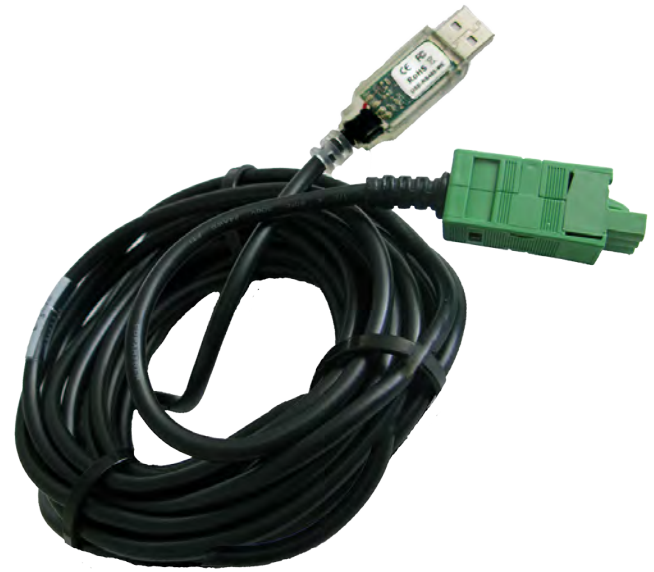
Part # MCS-USB-RS485