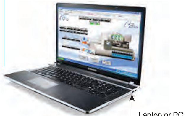
Laptop or PC USB Port

When MCS-USB-RS485 cable is plugged into a laptop or PC, Windows will install a device driver that allows the cable to be used as a standard Window communication port.