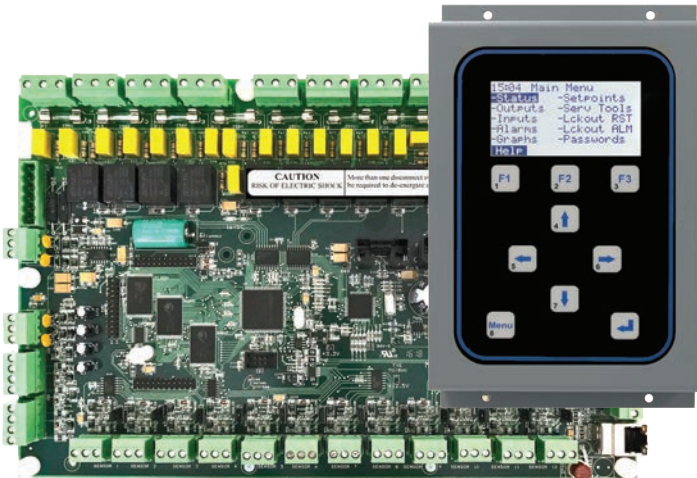
Part # MCS-MAGNUM-PANL