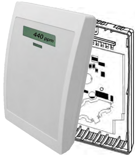
Part # MCS-CO2-W-LCD