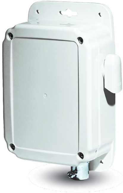
Part # MCS-CO2-OA