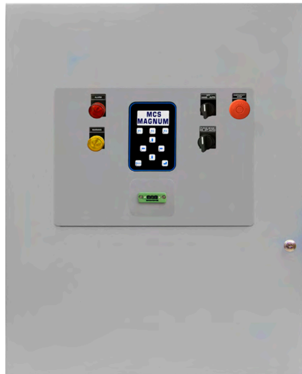
Photo shows MCS-RS-485-Extender mounted on front of enclosure

Size..... 5 foot Device Type..... RS-485 Weight ..... 0.1 lbs Operating Temperature Range ..... -400 to +85OC Max Bus Power Current ..... 250mA Data Transfer Rate ..... Up to 3Mbaud