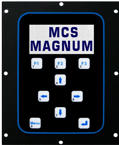
Part # MAG-KEYPAD-REPLACEMENT Replacement for all Non-Warranty Keypads