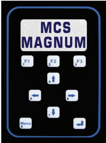
Part # MAG-KEYPAD-OEM-232