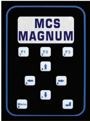
Part # MAG-KEYPAD-OEM-232-KIT