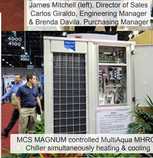
MCS MAGNUM controlled MultiAqua MHRC2 Chiller simultaneously heating & cooling