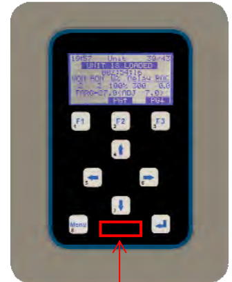
RS232 PORT REMOVED