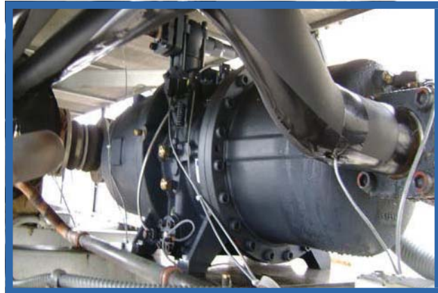
Hanbell RC2B-300 Compressor replacing SAL-175 screw compressor on a McQuay ALS Chiller

Compressor #2 had failed and compressor #1 was noisy. A decision was made to replace the compressors and upgrade the controls to the MCS-MAGNUM. Two days after the order for the compressors was placed, the 2nd McQuay compressor failed. The chiller was located on the roof of a 6 story building. A crane removed the 2 old compressors and set in place the new Hanbell compressors on a Wednesday. The compressors were set on an adapter plate, piping and wiring changes were completed for one circuit that was operating by Friday afternoon. The 2nd compressor was finished the next week.