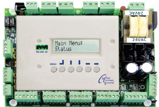
MicroMag - V6.1