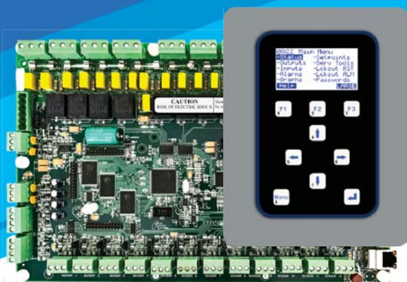
MCS Magnum Door