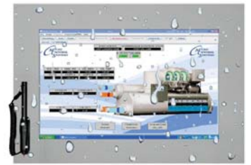
NEMA Type 4 Enclosure