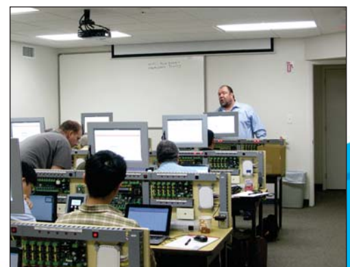
MCS Training Benches

Easiest to Use, Best Supported and Most Reliable