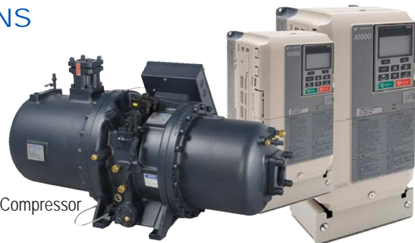
RC2 Screw Compressor