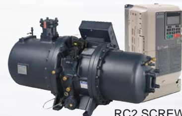
RC2 SCREW COMPRESSOR