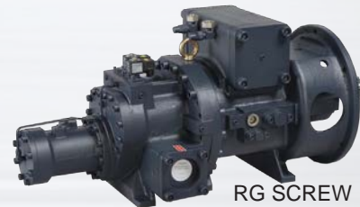
RG SCREW COMPRESSOR