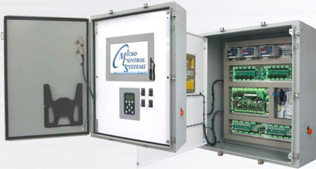
NEMA 4 ENCLOSURES