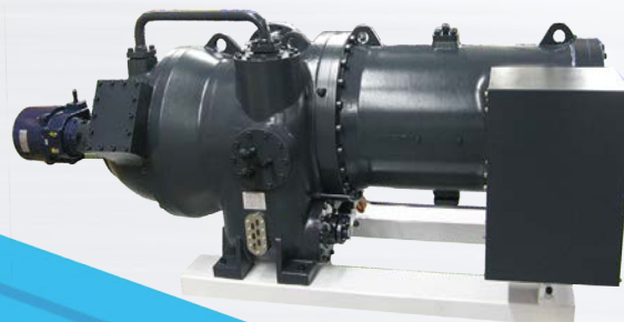
CENTRIFUGAL SCREW COMPRESSOR