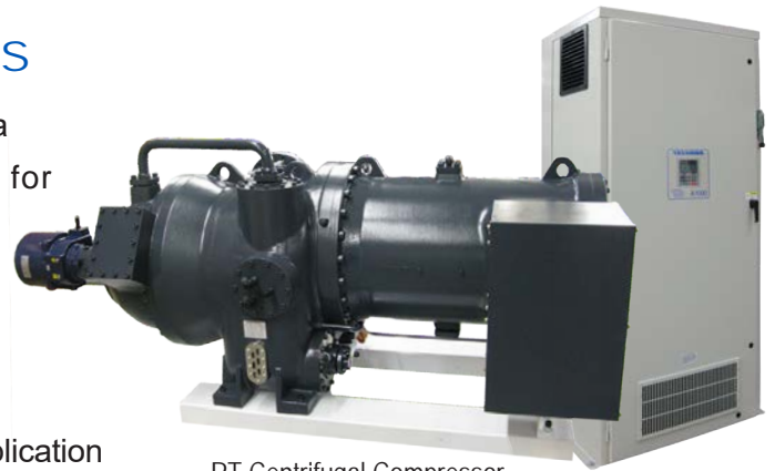
RT Centrifugal Compressor