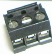
NEW CONNECTOR IN PLACE