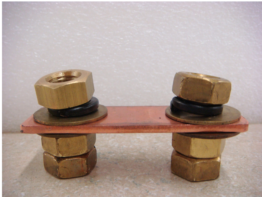
Photo shows extra nuts installed under jumper bar for clearance of power bolt Insulation.