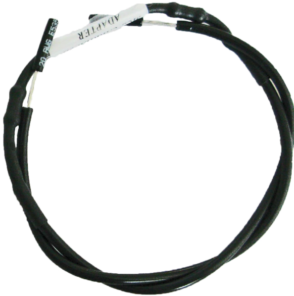
Part # MCS-CARRIER-5K-ADAPTER